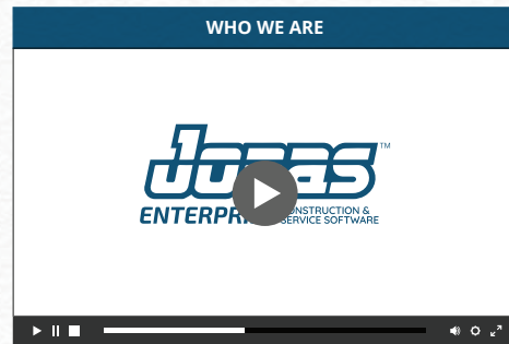
Find out what we believe