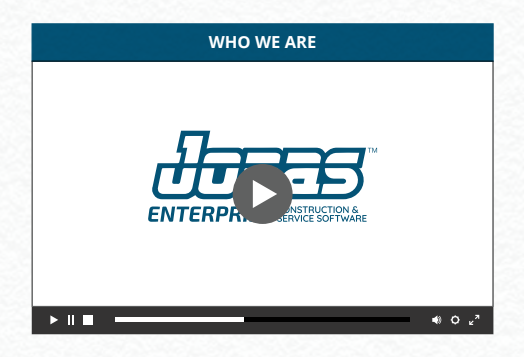
Find out what we believe