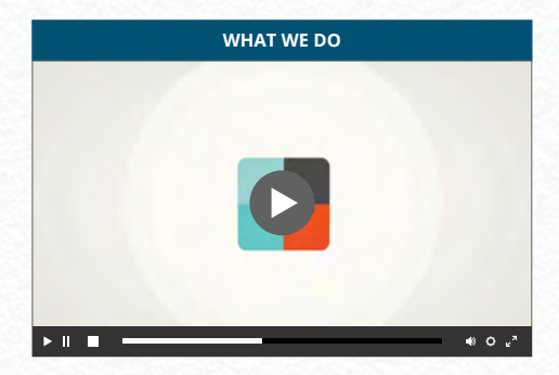
Watch our 90 second video